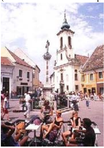
Szentendre Tour (Guaranteed in case of 15 pax!)

Half-day excursion to the most scenic part of Hungary. The tour includes a visit to Szentendre, the artists' town with its cobbled-stone squares and picturesque old streets and alleys. After a short guided tour of the town, you'll visit the Kovács Margit Ceramic Museum, a unique place that exhibits the works of a very special Hungarian artist, who created her own style by combining modern art forms with the traditions of Hungarian folk art.